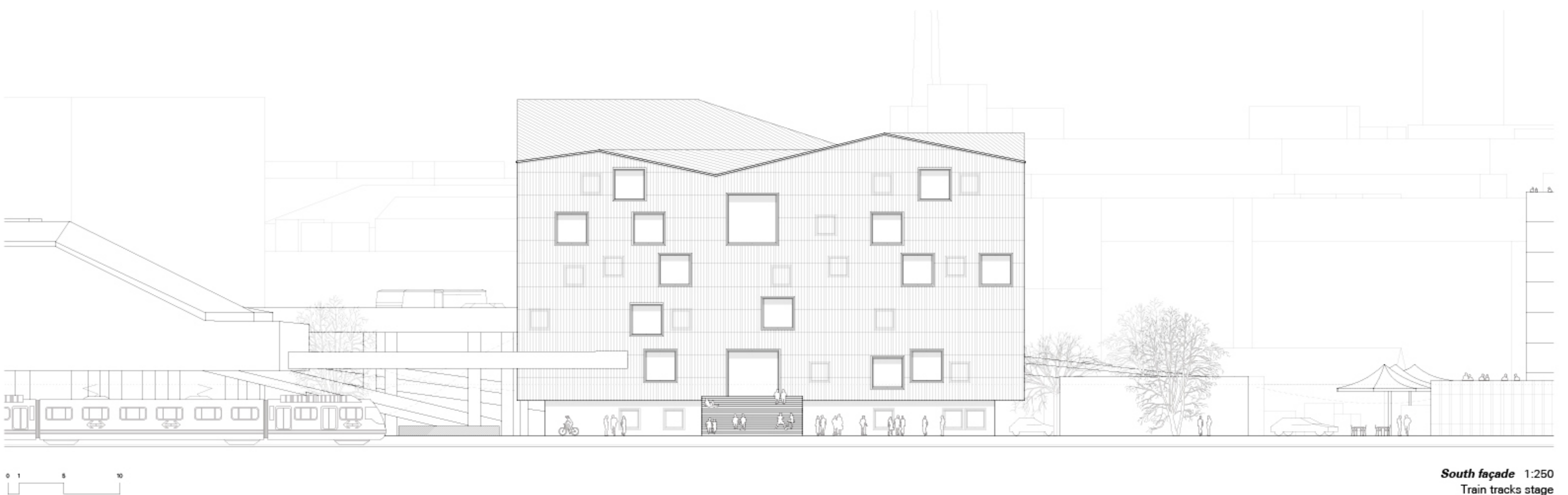
South façade 1:250 Train tracks stage