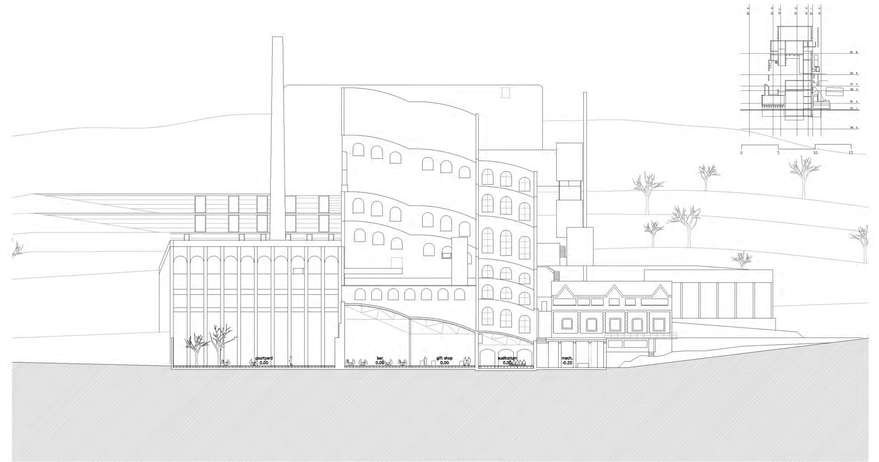
X1 Cross section. 1.300