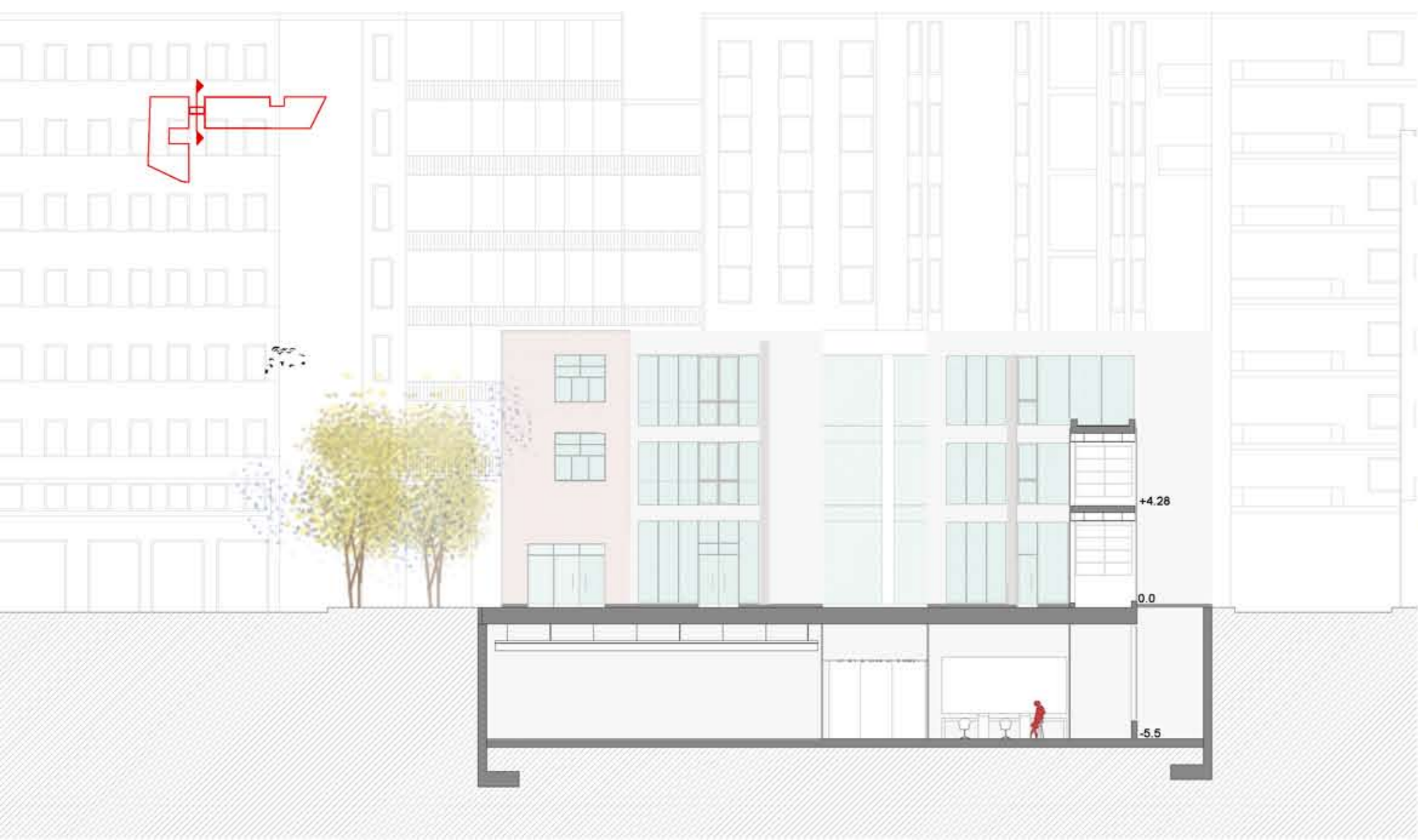
Sección 4 E/ 1:200