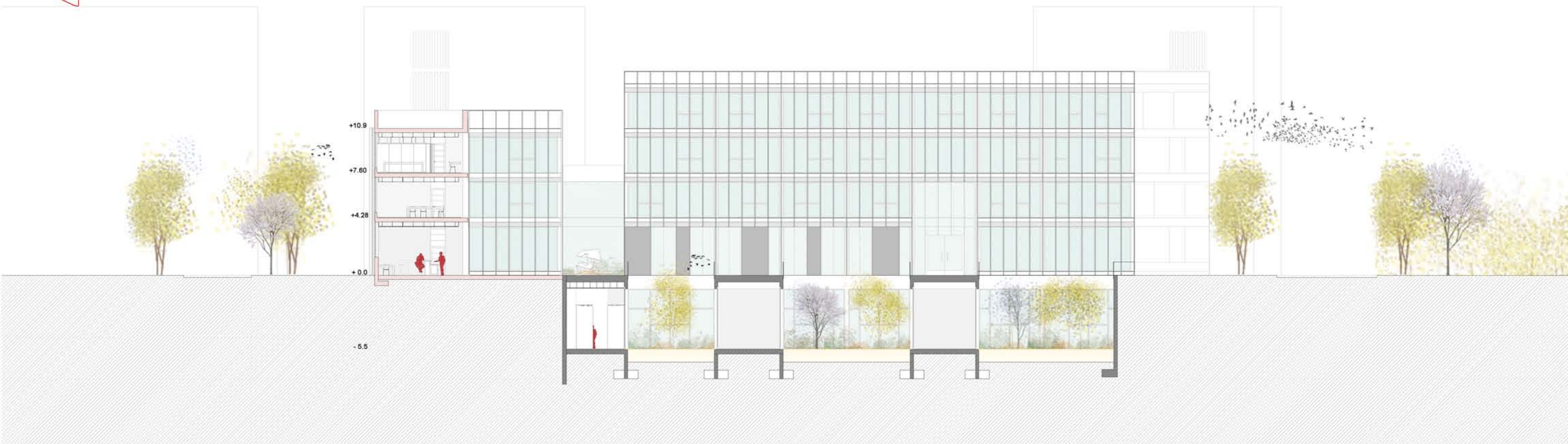
Sección 3 E/ 1:200