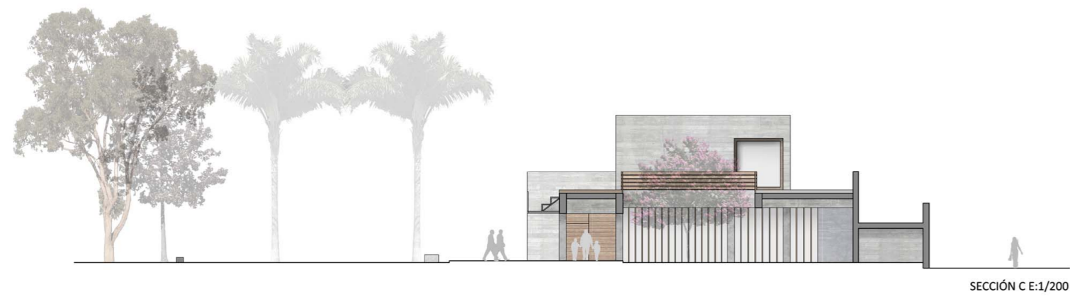
SECCIÓN C E:1/200