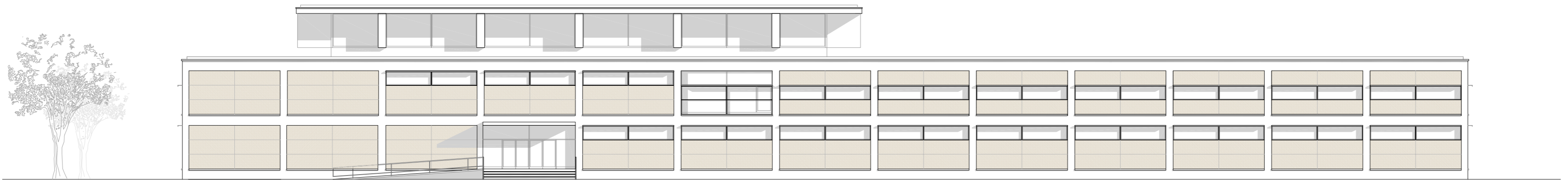
ALZADO SURESTE [A-SE]