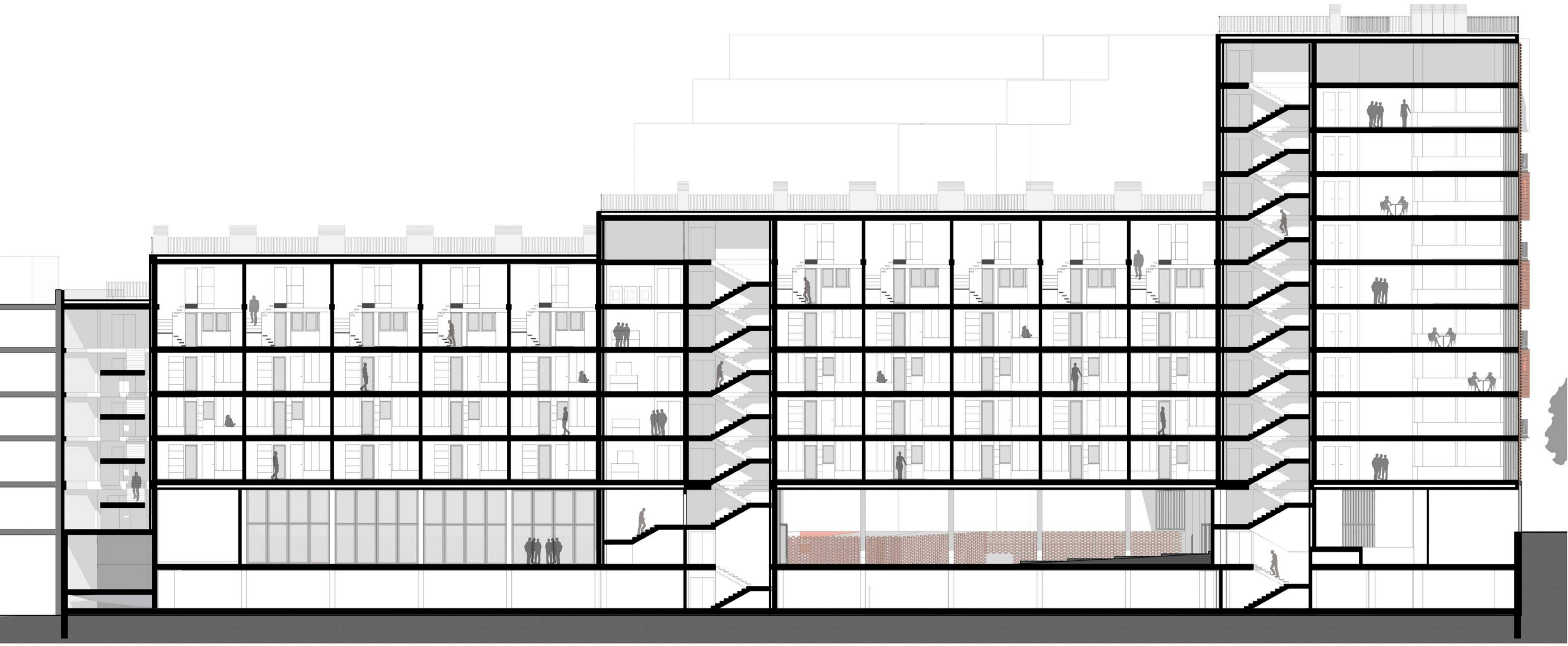
SECCION LONGITUDINAL E 1:200