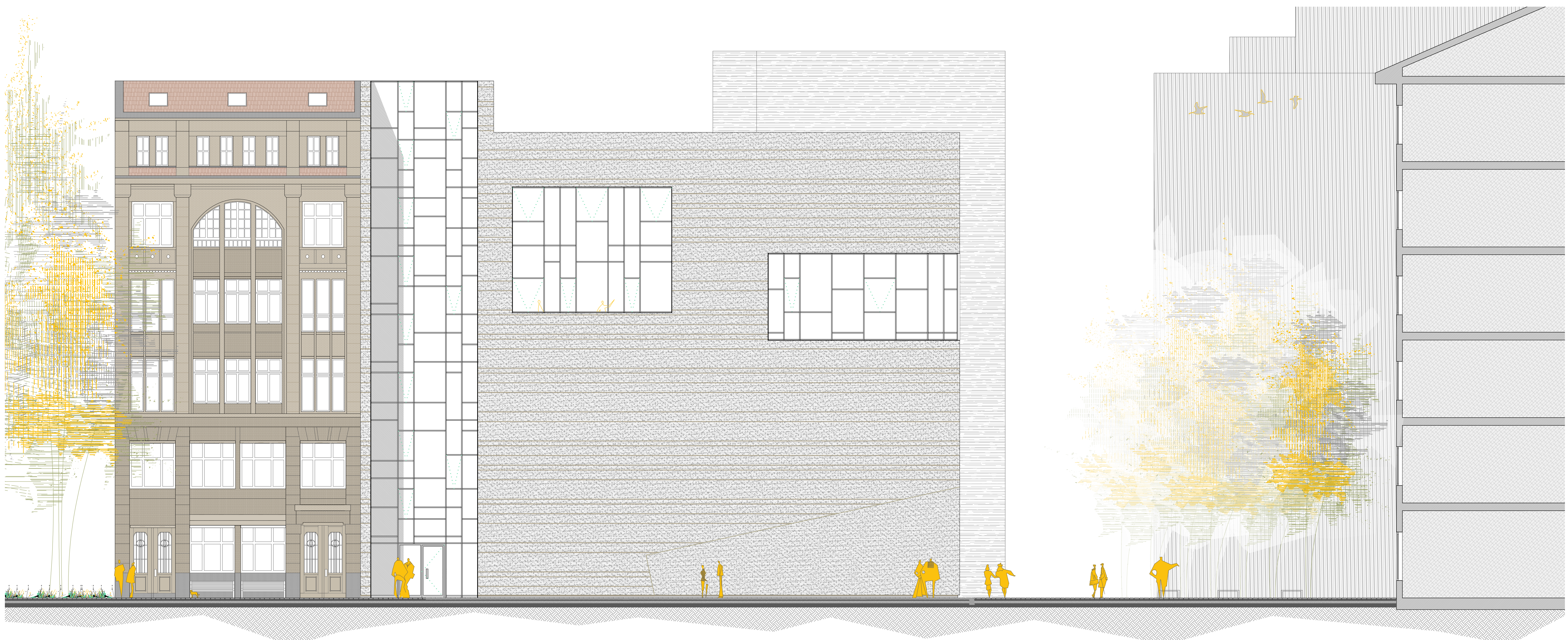
ALZADO SUR - OESTE 1:100