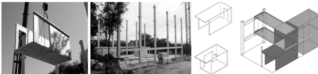
Figure 3. "El Polvorí" structural components: 3D module, column-beam frame, IFD configuration model

Building Structure is integrated systems configuration composed of three independent subsystems: i) 3D modules – customized, prefabricated components for particular design, ii) IFD frames from precast concrete columns and beams, iii) hollow core floor slabs. This integrated "Kit of parts" system is composed of beams, columns and slabs as standardized components and "customized" 3D modules (Fig.3)