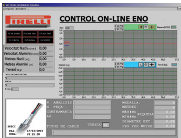
Operator's front-end display, it allows us to verify the correct functioning of the equipments which configure the system and provides information about the parameters: velocity (m/s) and length (m) of the nucleus and aluminium and tension.

In the manufacturing process of telecommunications cable with optic nucleus, it is fundamental to avoid stretching of the interior fibre optics which would increase the attenuation of the signal. The amount of optic nucleus inserted inside the coating has to be controlled in order to assure that the traction margin is enough to meet the mechanical specifications of cable charge in service. In the particular case of OPGW conductor (Optical ground Wire), Pirelli Telecom Cables and Systems S.A together with Technological Development Centre SARTI, have developed a specific application which allows us to control the differential nucleus with respect to an aluminium tube during the process of emptying the aluminium nucleus, using a parameter called richness (quotient between optical nucleus length and coating).