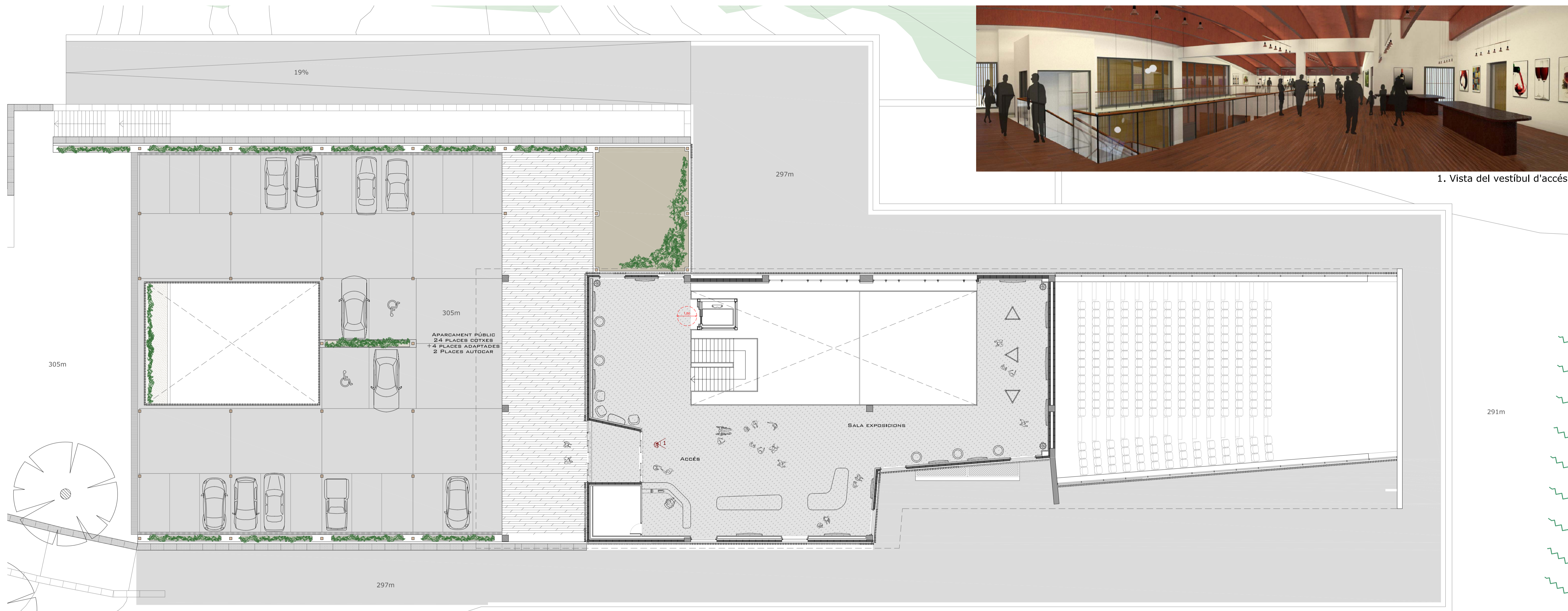
1. Vista del vestíbul d'accés