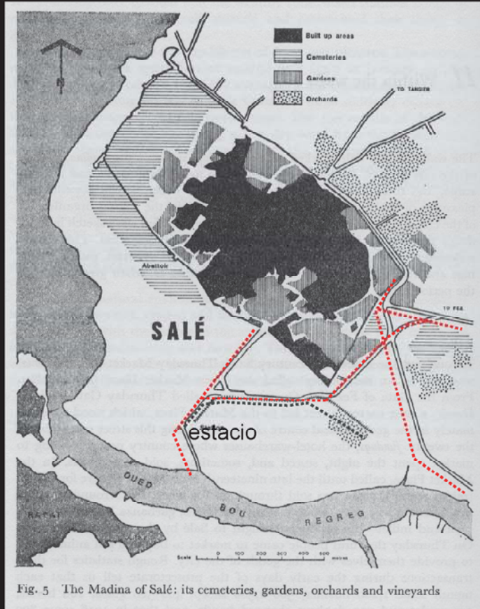
Fig. 5 The Madina of Salé: its cemeteries, gardens, orchards and vineyards