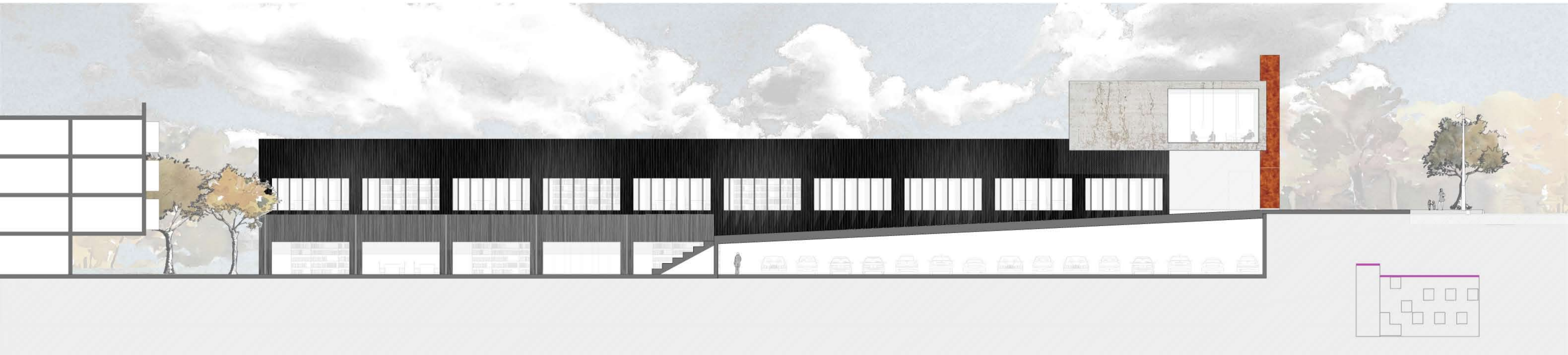
façana NW 1:150