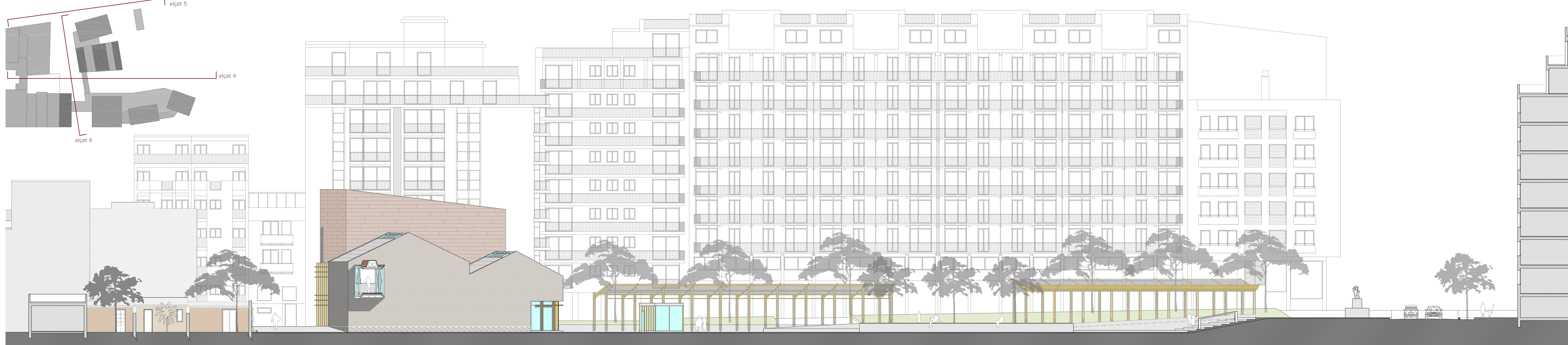
alçat 4, e.1/200