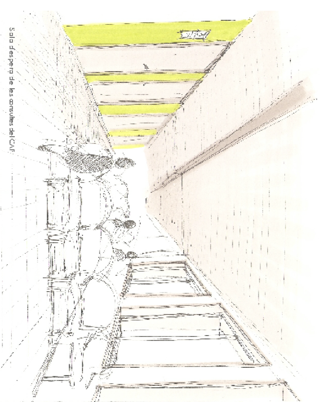
Sala després de les sessions del CAE