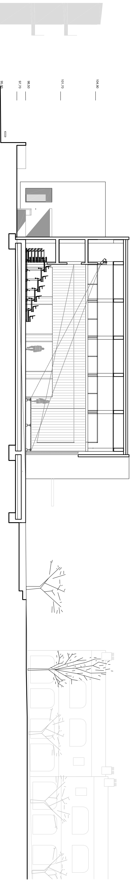
SECCION TRANSVERSAL_3 F-F'