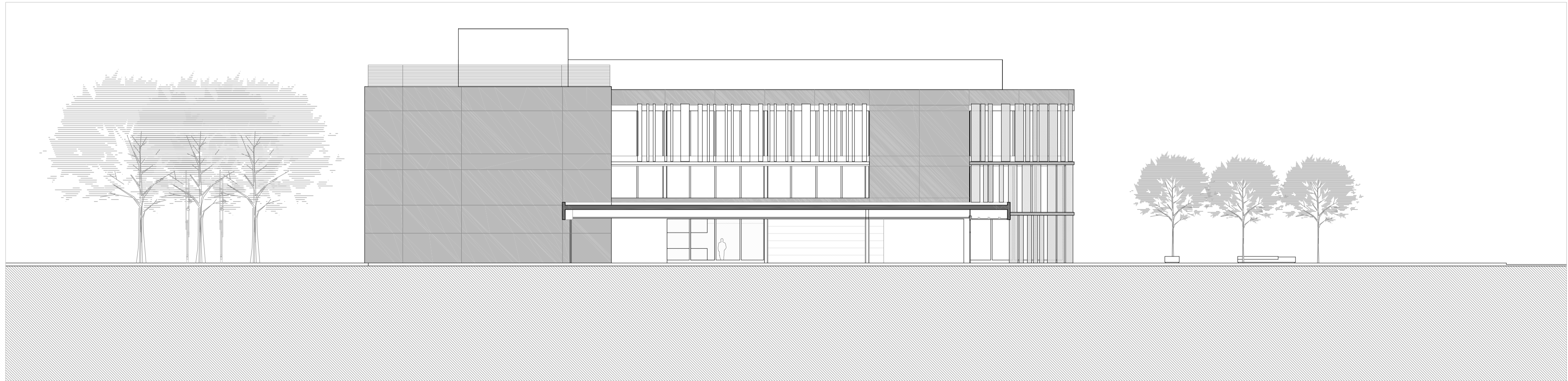
ALZADO F-F esc. 1/200