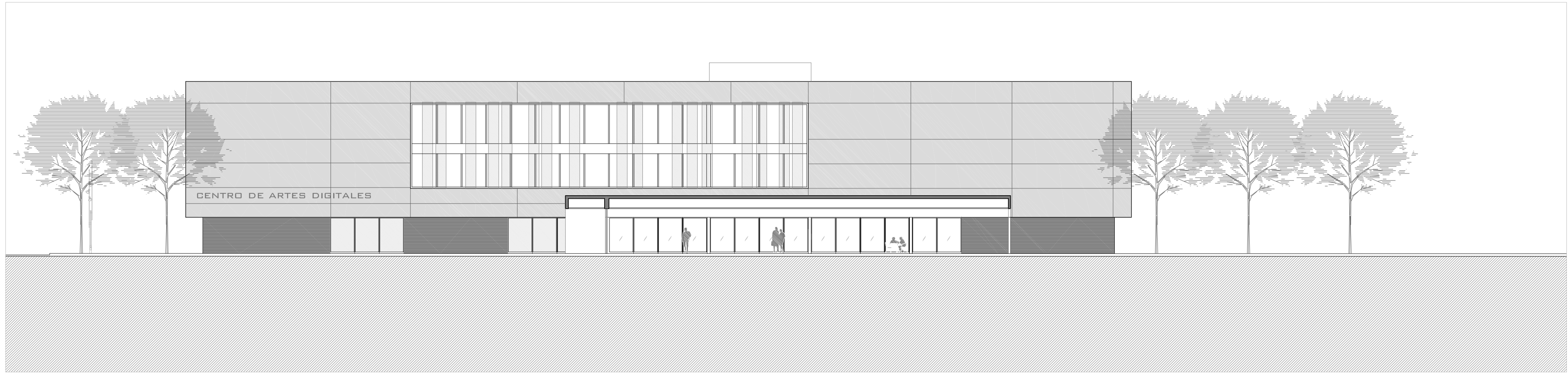
ALZADO E-E esc. 1/200